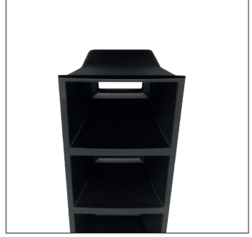
BM lens shade