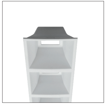
WM lens shade